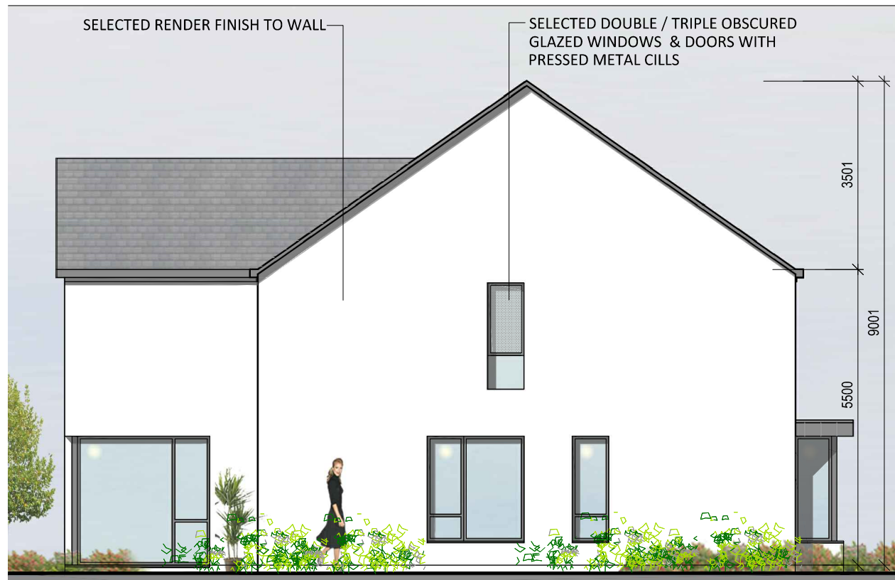
SIDE PUBLIC ELEVATION scale 1:100